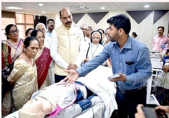
Guests and others visiting the Lab of ITC at Greater Noida premises of TNAI