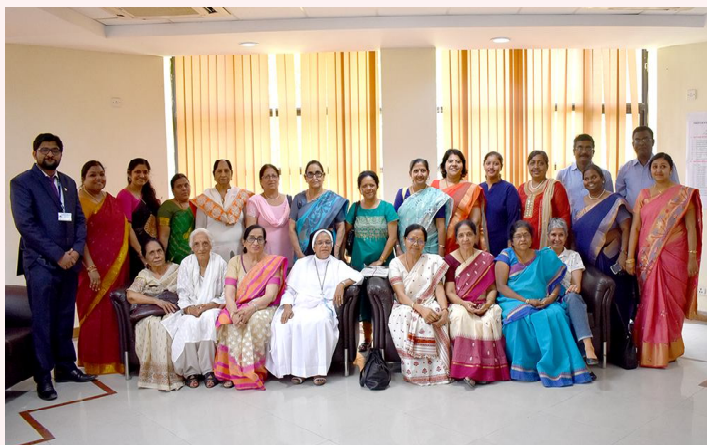
Group photograph of chief guest with EC / Council members and others