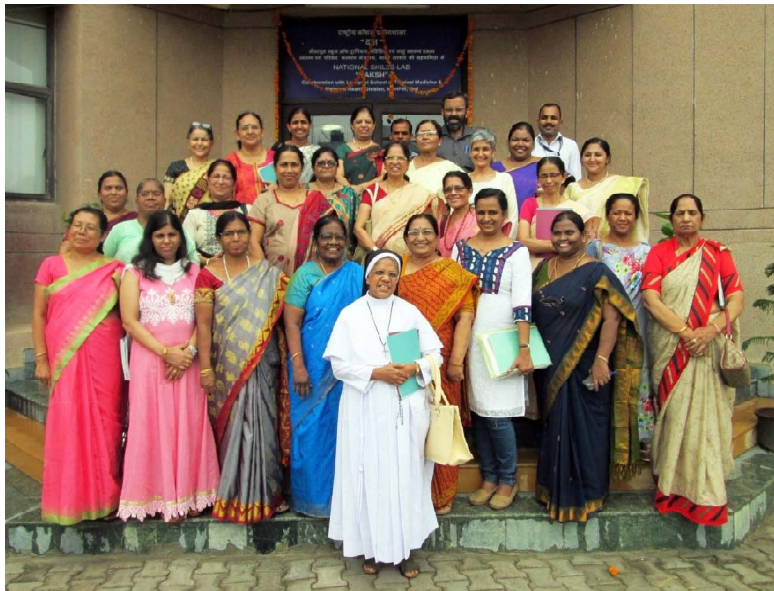
Group photograph of Executive members, TNAI

The National Skills Labs seek to provide a platform for augmenting the Skills of Health personnel involved in the delivery of RMNCH+A services across public health institutions in the country. After setting up of tripartite [LSTM, TNAI and Ministry of Health and Family Welfare (MoHFW)], The National Skills Lab at TNAI, Greater Noida (UP) was established in 2014. Its objectives are: Improving the maternal and newborn health services in the country; Enhancing competencies of the health care providers under RMNCH+A services in the Public Institutions; Reducing the MMR and the IMR in India; Facilitating acquisition/ reinforcement of standardised technical skills and knowledge of service providers for RMNCH+A services; Improving the quality of pre-service training and; Providing continuing Nursing education / continuing medical education. The MoU between TNAI and MoHFW was signed in June 2016. So far the National Skills Lab (Daksh), TNAI, Greater Noida has conducted ten training covering 107 participants from ten States.